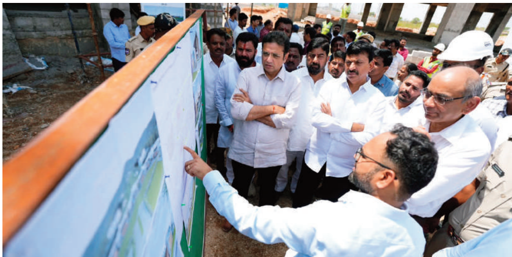
Highlighting the focus on youth empowerment and skill development, the Minister said the Young

He noted that despite facing several challenges, the government was steadily overcoming hurdles and executing the ambitious project at a rapid pace. He described Future City as a landmark initiative aimed at creating a unique urban ecosystem unlike any other in the country.