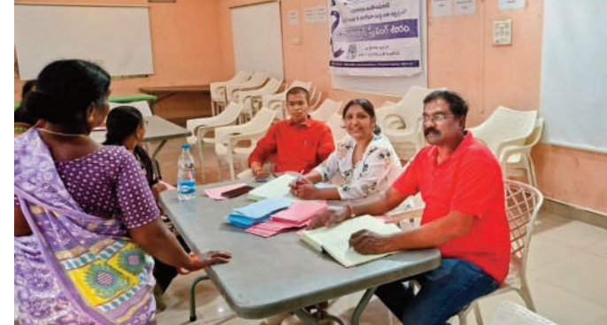
Highlighting the importance of timely screening in identifying cancer at an early stage, Press Club President

Around 150 journalists availed themselves of the screening services. Senior journalists expressed appreciation for the Press Club's proactive initiative in facilitating early detection and preventive healthcare.