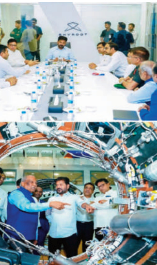
Chief Minister A. Revanth Reddy (left) and Industries Minister Duddilla Sridhar Babu (right) with the Vikram-1 rocket.

said the government aims to position Telangana as a global aerospace leader by 2047. Highlighting industrial growth, the Chief Minister said Telangana recorded the highest increase in engineering goods exports in the country — 117.9% between 2023–24 and 2024–25