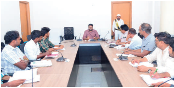
state government has undertaken the Indiramma housing scheme with the objective of fulfilling the dream of owning

On Wednesday, he conducted a review meeting with engineers at the Mini Meeting Hall to assess the progress of the housing works. Speaking on the occasion, the Additional Collector stated that the