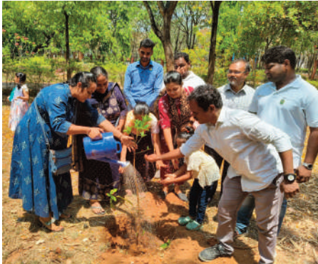
Digital Connection : Through Tag a TreeThe Centre introduced an innovative "Tag a Tree" initiative. Participants used QR tags to assign digital identities to trees across the campus, utilizing technology to

(Capital Information) Tirupati : The Regional Science Centre, Tirupati, in collaboration with the AP National Green Corps, Tirupati District, organized a series of eco-conscious activities today to celebrate Earth Day 2026. Centered on the theme "Our Power, Our Planet," the awareness programme saw active involvement from students and the public.