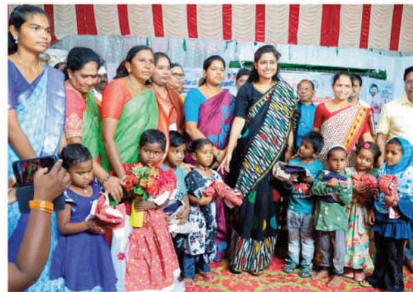
houses by providing loans through bank linkage.

He said that the process of distributing ration cards is continuing continuously, and bills are being paid to the beneficiaries of Indiramma houses on time every week according to the construction stages. He clarified that steps are being taken to ensure that bills are not pending anywhere. He said that steps are being taken to complete the construction of