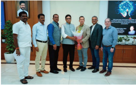
(GCC) in the city.