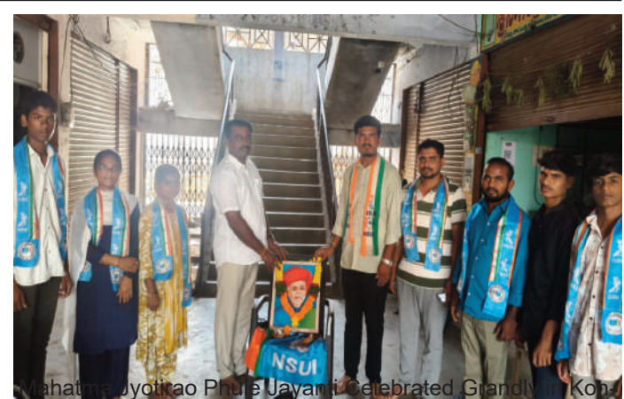
Mahatma Jyotirao Phule Jayanti Celebrated Grandly in Kondamallepally

The event witnessed active participation from leaders, cadres, and local residents.