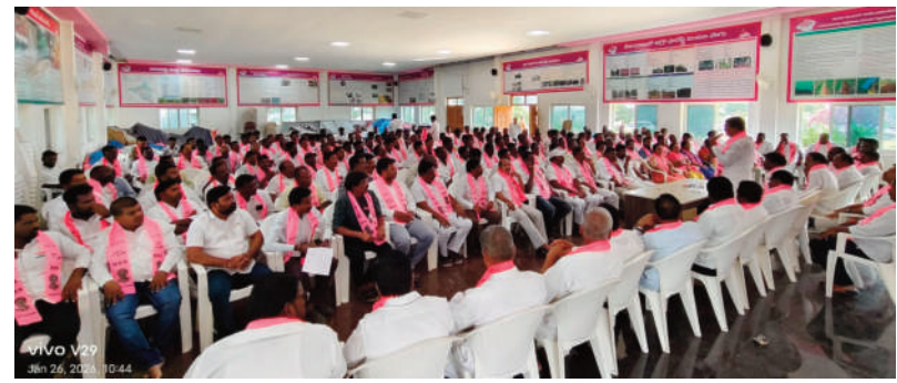
Massive Rally in the Town