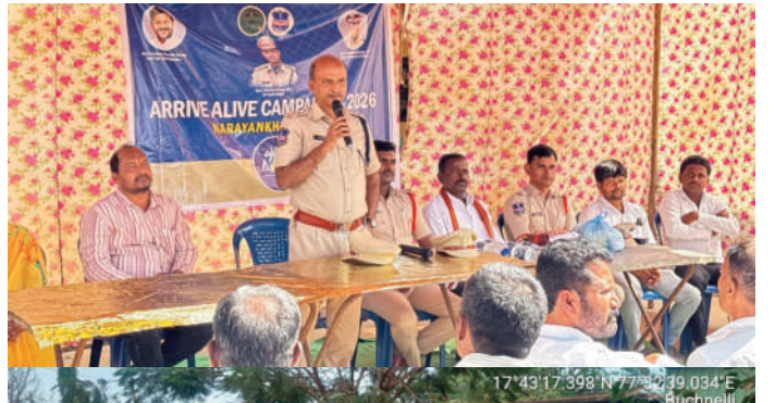
programs about traffic rules are being organized in various police stations across the District.

(Capital Information) Sangareddy : "Arrive Alive - 2026" is a special movement jointly organized by the police, transport and health departments with the aim of reducing road accidents and saving people's lives, and various awareness programs on road safety will be organized for 10 days, informed District SP Paritosh Pankaj. Speaking on the occasion, the District SP briefly explained the use of helmets and seat belts, the importance of first aid, and defensive driving rules. He appealed to the people to follow traffic rules, wear helmets and seat belts, contribute to the safety of themselves and others, and reach their destinations safely by driving safely. As per the instructions of the District SP, awareness