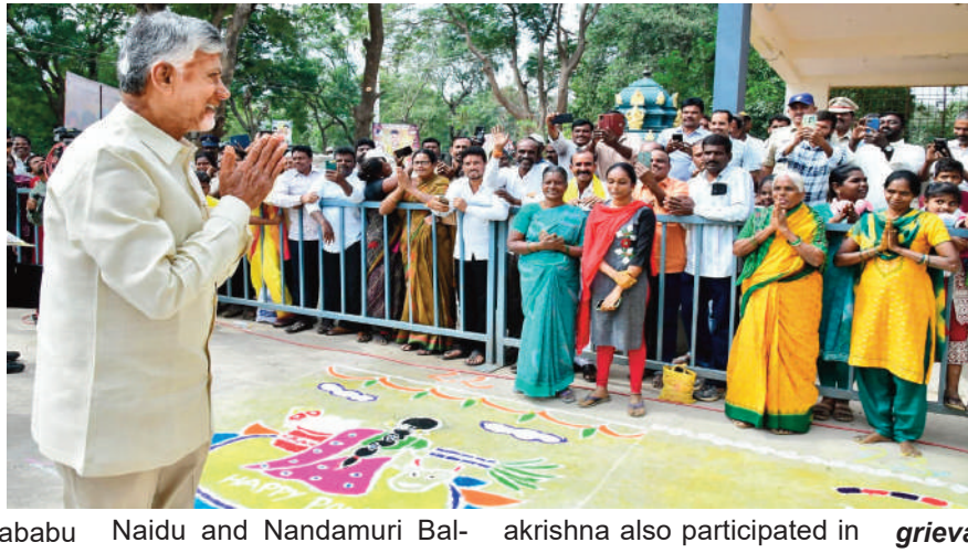
Naidu and Nandamuri Balakrishna also participated in

ance walking, gunny bag race, lemon and spoon, cockfight, three-leg race, and glass and balloon run were organized for the local children. Engagement with children and villagers Chief Minister Chandrababu Naidu watched the competitions with great interest and enthusiasm. The grandsons of Chief Minister Chandrababu