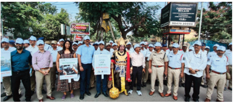
attention from commuters.

(Capital Information) Hyderabad: In a striking and imaginative road-safety campaign, the Sarvejana Foundation has brought Yamadharm Raja the mythological God of Death to Hyderabad's busiest junctions to remind commuters that life has no reset button.