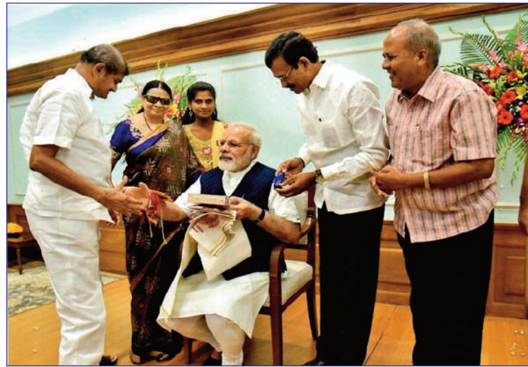
Visited Delhi to greet Hon'ble Prime Minister Narendra Modi on 7th August 2018 on the eve of Rakhi Purnima.