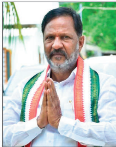
Several senior leaders and dignitaries are expected to grace the event.