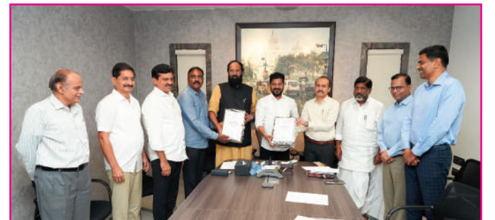
The report submitted by the PC Ghosh Commission on Kalashwaram was presented to Chief Minister Revanth Reddy by officials in the presence of Deputy Chief Minister Bhatti Vikramarka, Ministers Uttam Kumar Reddy and Ponguleti Srinivas Reddy.

The minister explained that plans have been prepared for the outer ring road to the regional ring road to provide easy and safe access to district centers and that they are going to be completed in two years. He said that during (Cont. on Pg 2)