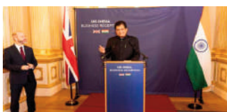
India, UK close to clinching trade deal as Commerce Minister Phyush Goyal wraps up talks in London - P5

Forecast : Sunny Temperature : 37° / 26° Humidity : 34 % Sunrise : 5:57 AM Sunset : 6:50 PM